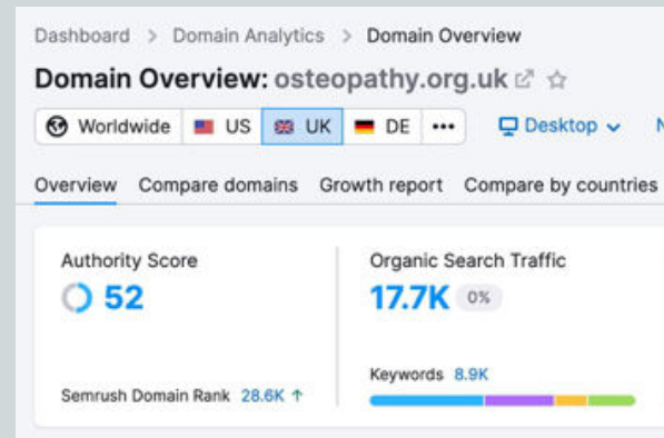
Figure 4: Your domain authority is a large factor in your SEO rankings