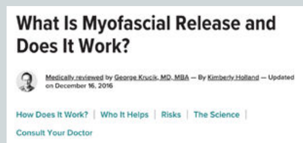
Figure 3: With any medical information it is crucial to demonstrate to Google that it has been written or reviewed by a qualified professional